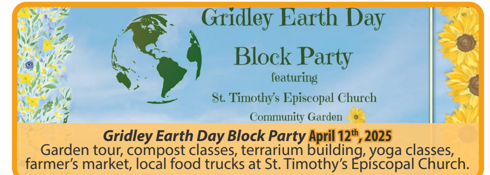
Gridley Earth Day Block Party April 12 th , 2025 Garden tour, compost classes, terrarium building, yoga classes, farmer's market, local food trucks at St. Timothy's Episcopal Church.