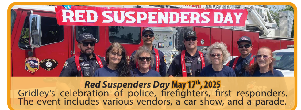
Red Suspenders Day May 17 th , 2025 Gridley's celebration of police, firefighters, first responders. The event includes various vendors, a car show, and a parade.