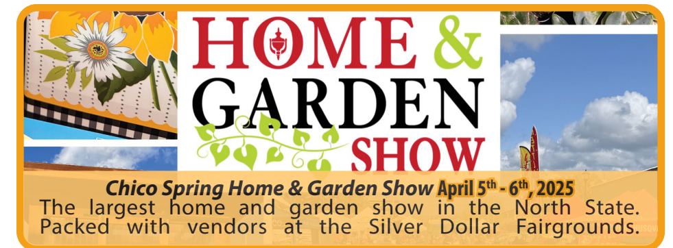
Chico Spring Home & Garden Show April 5 th - 6 th , 2025 The largest home and garden show in the North State. Packed with vendors at the Silver Dollar Fairgrounds.

Invasive Aedes aegypti brochures, mailers and door hangers will be distributed at public events and in the immediate vicinity of increased detections of invasive mosquitoes.