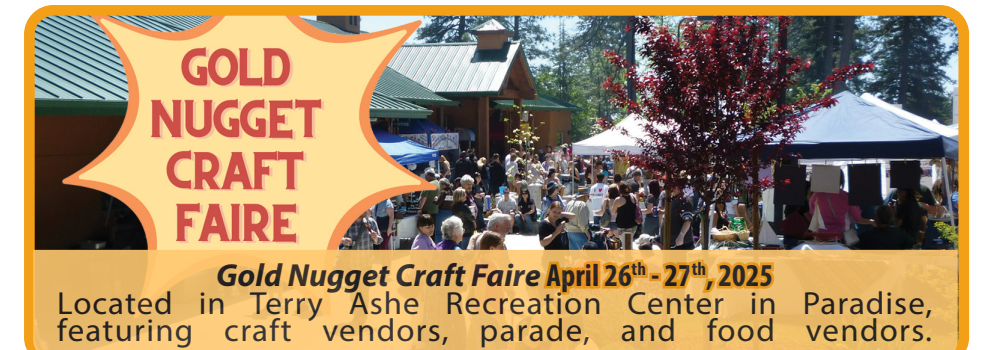
Gold Nugget Craft Faire April 26 th - 27 th , 2025 Located in Terry Ashe Recreation Center in Paradise, featuring craft vendors, parade, and food vendors.