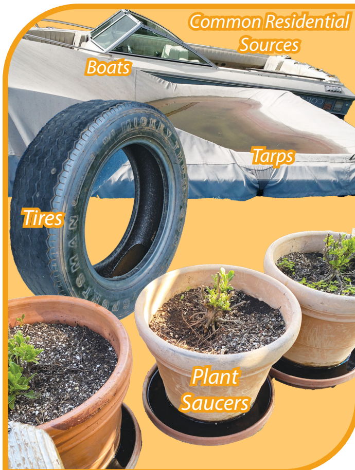
Common Residential Sources

Together, with the help of the District's Mosquito and Vector Control Specialists, who respond to community reports with targeted field investigations, we can build a unified, sustainable approach to tackling mosquito-borne diseases and ensuring a healthier future for Butte County.