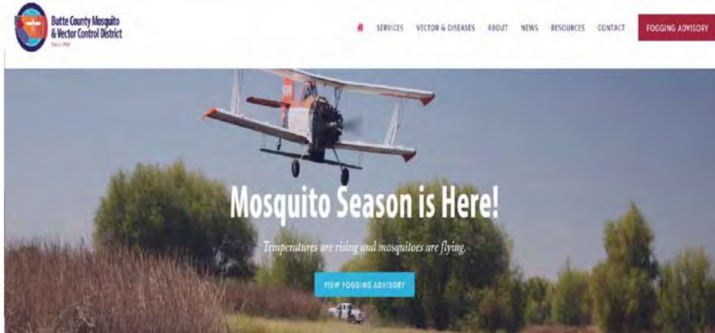
Screen Shot From New Website

After nearly 12 years, the District has a new website. The old website was getting dated, with concerns growing over security issues, lack of support, and noncompliance with new ADA and State regulations. The new website, built by Matson and Isom of Chico, is very user friendly, is accessible in phone, tablet, or PC mode, and is constantly monitored by Matson and Isom for security concerns, updates, licenses, and compliance issues.