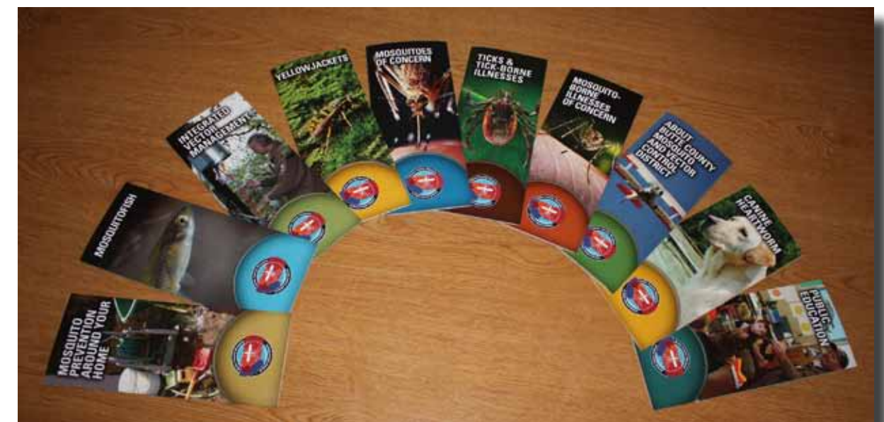
District Public Education Brochures