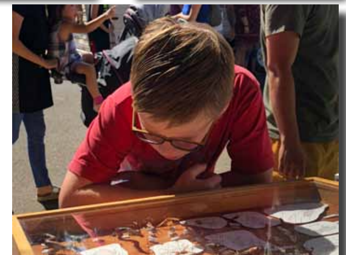
Public Education Photos