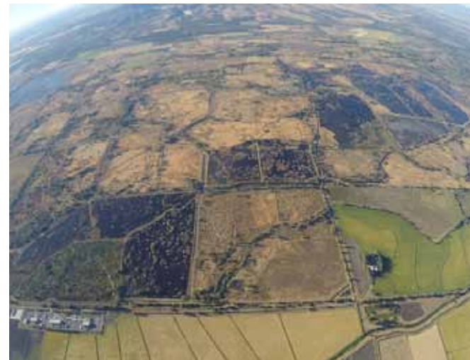
Aerial Photographs of Wetland Areas