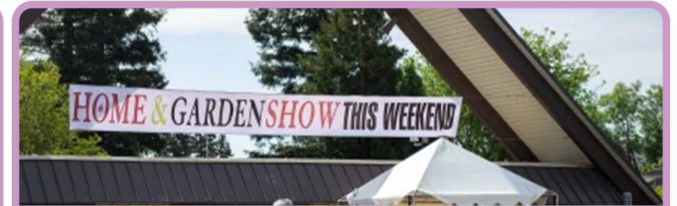
Chico Spring Home & Garden Show April 6 th & 7 th , 2024 The largest home and garden show in the North State. Five buildings packed with vendors and outdoor displays at the Silver Dollar Fairgrounds