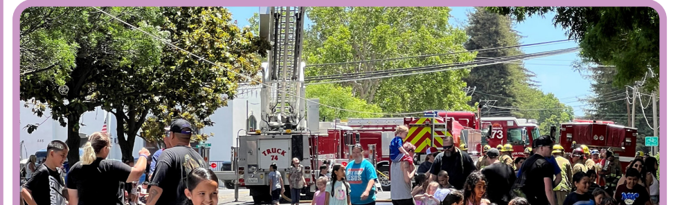
Red Suspenders Day May 18 th , 2024 A celebration of local police and firefighters held in downtown Gridley. The event includes vendors, a car show, a parade and more.