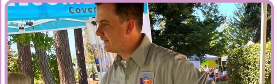
Gold Nugget Craft Faire April 27 th & 28 th , 2024 Located in Terry Ashe Recreation Center in Paradise, featuring a variety of craft vendors, a parade, and an assortment of food vendors.