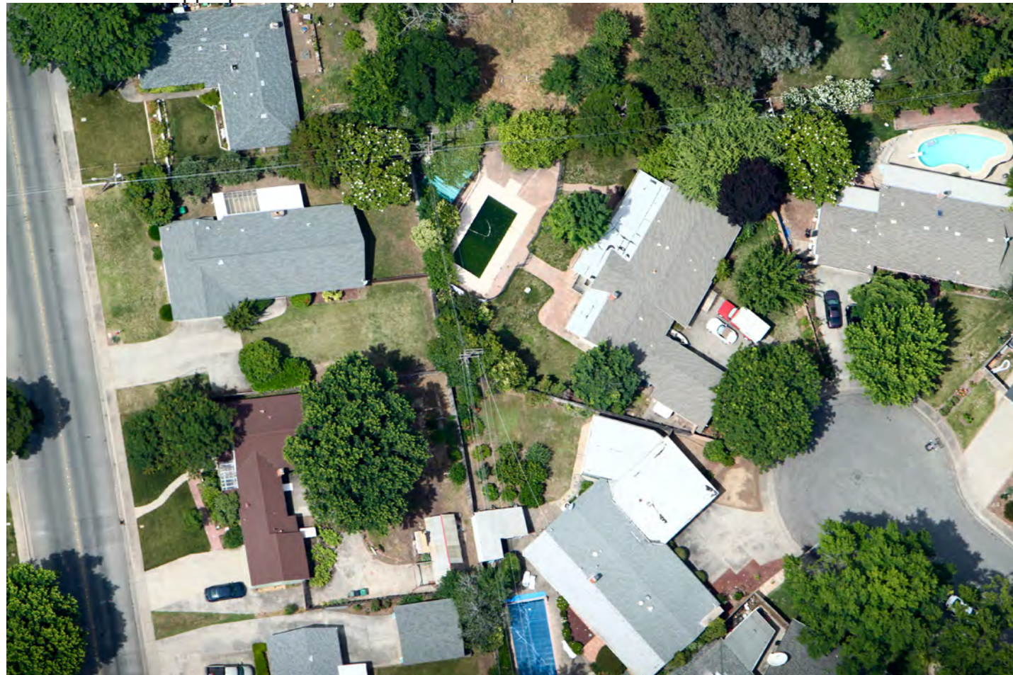
Example of an aerial photograph